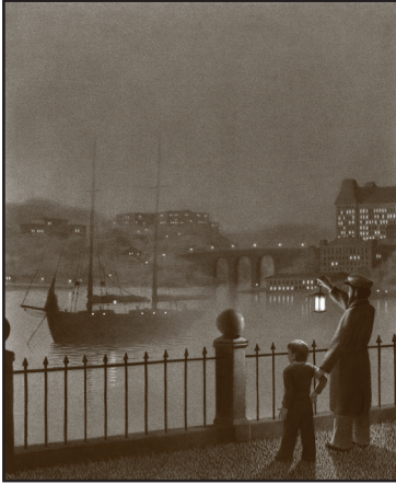
He swung his lantern three times and slowly the schooner appeared.