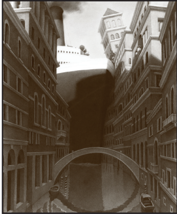
Even with her mighty engines in reverse, the ocean liner was pulled further and further into the canal.