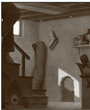
His heart was pounding. He was sure he had seen the doorknob turn.