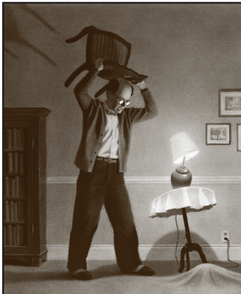
Two weeks passed and it happened again.

What do you think Archie will find if he goes to the park tomorrow to look in the bushes?