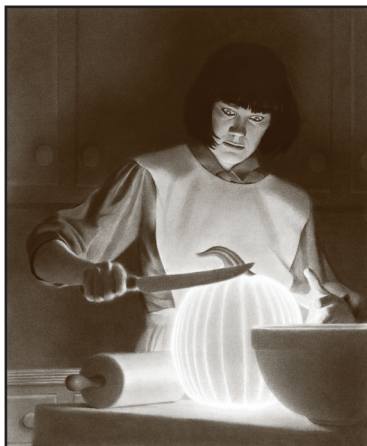
She lowered the knife and it grew even brighter.

Pearlie believes the break in the wallpaper pattern is proof of something. What do you think it is proof of?