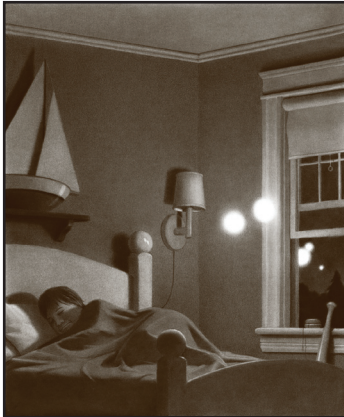
A tiny voice asked, "Is he the one?"

What do you think of Mr. Snicket's theory regarding Burdick's disappearance and authorship of the stories? Is it sound? Do you have an alternative theory?