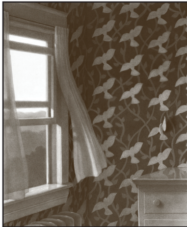
It all began when someone left the window open.