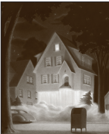
It was perfect lift-off.

Do you think that when the caterpillars transform into butterflies they will still communicate with Alice?