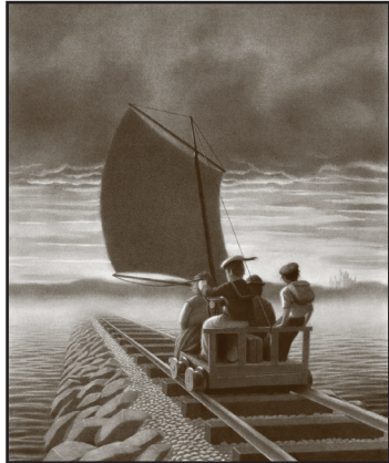
If there was an answer, he'd find it there.