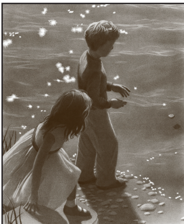
He threw with all his might, but the third stone came skipping back.

What do you think Mary Elizabeth will do to Timmy and Tina?