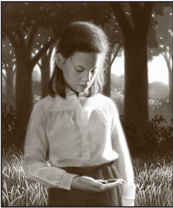
She knew it was time to send them back. The caterpillars softly wiggled in her hand, spelling out “goodbye.”

How does Captain Tory change Paul’s life?