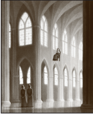
The fifth one ended up in France.