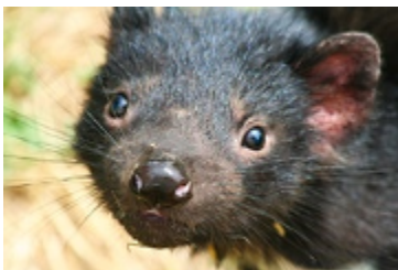
Devil's Face