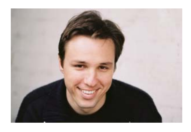
Markus Zusak THE BOOK THIEF