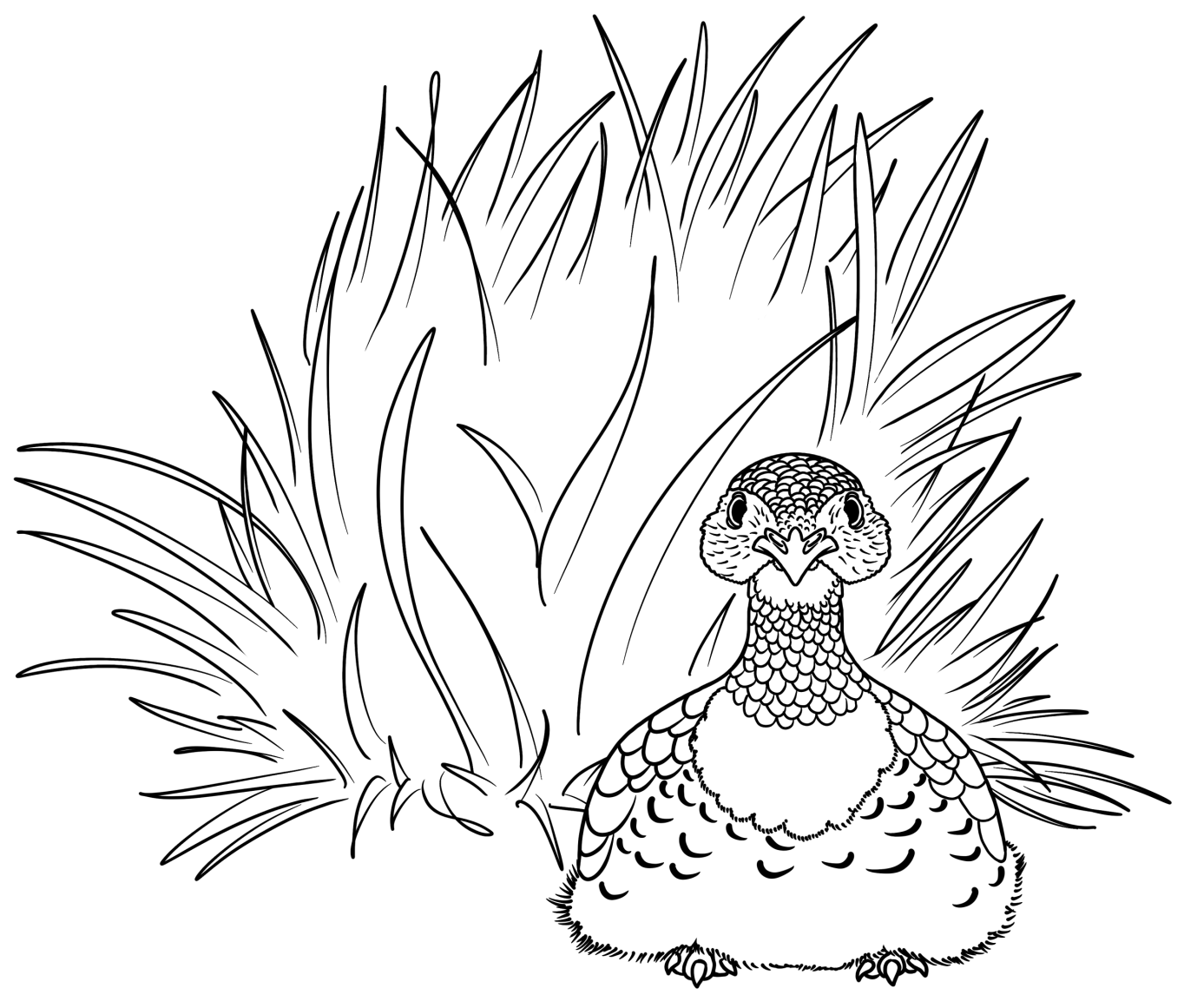
Illustration © Julian Teh

Colour in the picture and then label it with the scientific name of the Plains-wanderer. (Hint: Read the section 'About the Plains-wanderer' at the end of the book.)