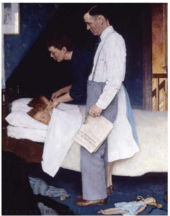
Freedom from Fear

Norman Rockwell Art Collection Trust, The Norman Rockwell Museum at Stockbridge