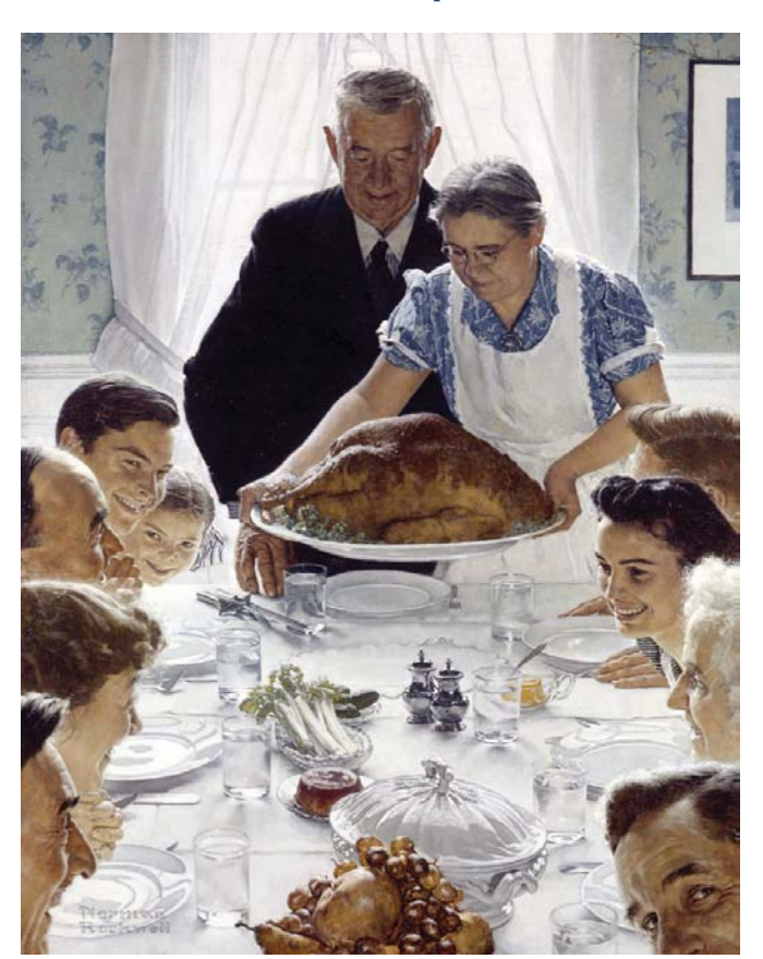
Freedom from Want