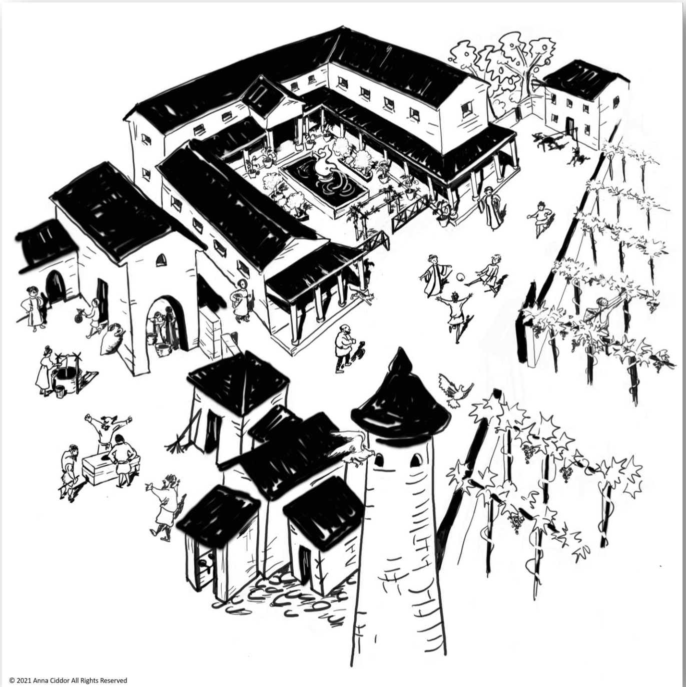
ILLUSTRATION 1: Villa Rubia