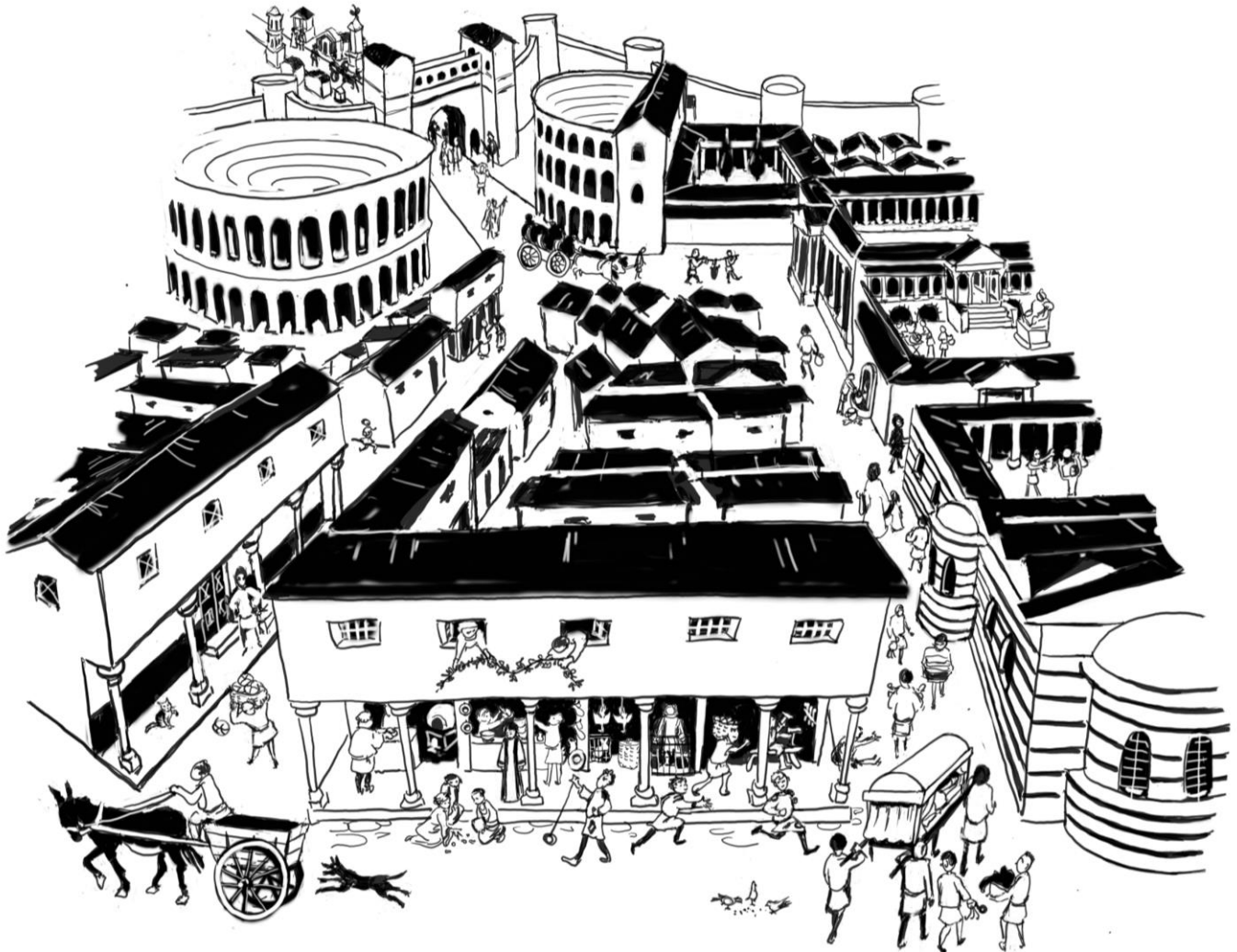
ILLUSTRATION 2: Arelate